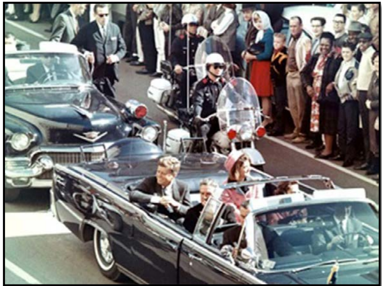
President Kennedy in the limousine in Dallas, Texas, on Main Street, minutes before the assassination.