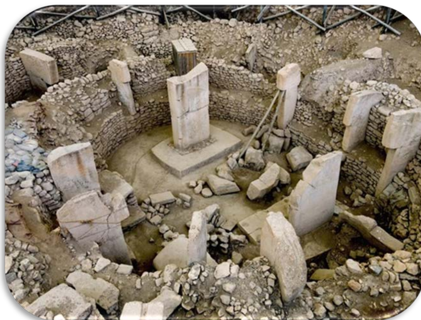
Ancient Site of Göbekli Tepe in Southern Turkey