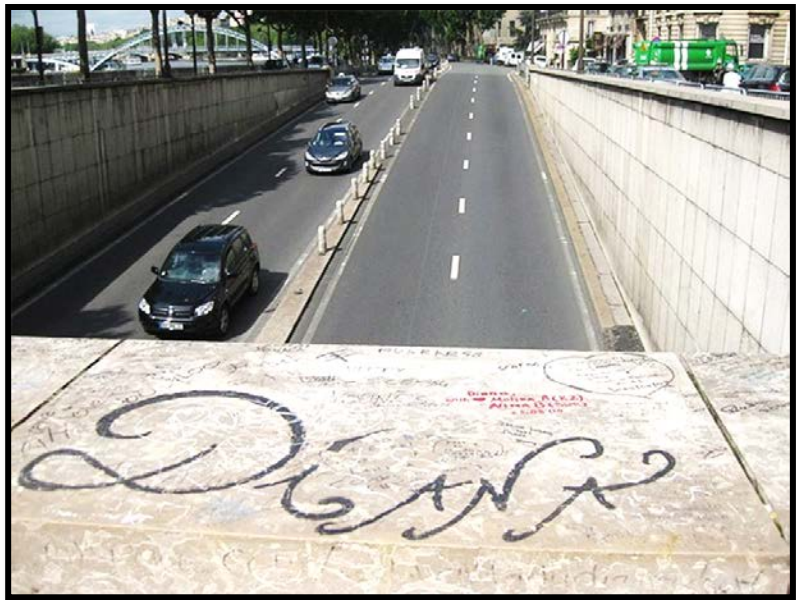
Site near to Lady Diana's fatal road accident, Paris, France.