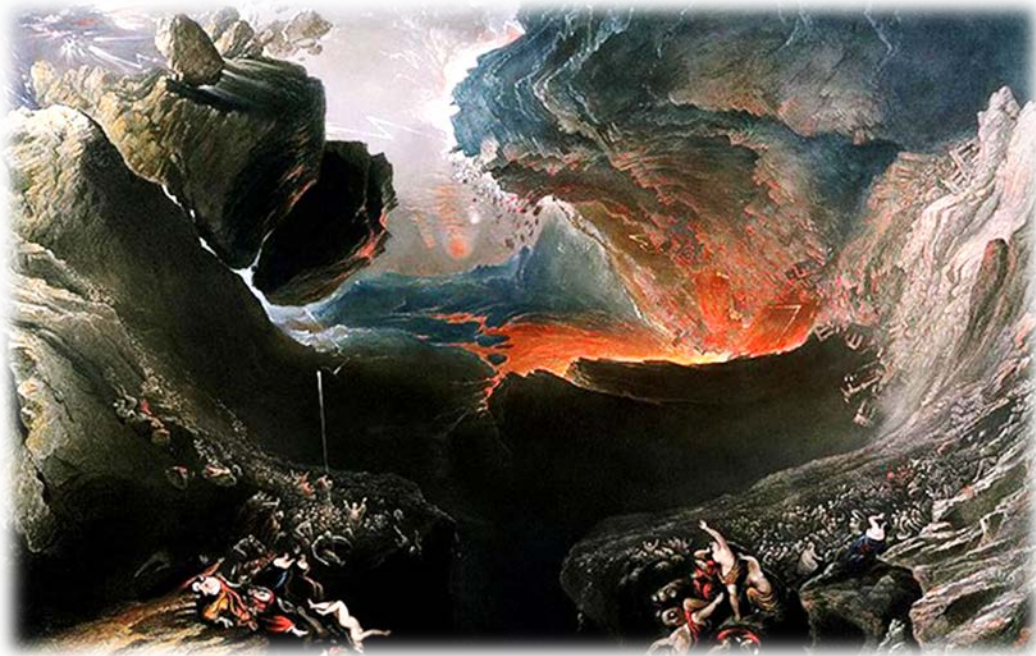
The End of the World, painting also known as The Great Day of His Wrath by John Martin (1853)