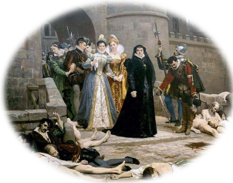
Catherine de Medici gazing at Protestants massacred in the aftermath of the massacre of St. Bartholomew by Édouard Debat-Ponsan (1880) Musée d'Art Roger-Quilliot